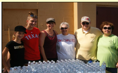
New Hope Lutheran at Unity Park on Saturday, July 9th. This group delivered bags, neck coolers, magazines and water .

What is Unity Park? Homeless shelters typically provide overnight accommodations, breakfast and a sack lunch. The residents then have to leave the facilities during the day. Unity Park is located in Fort Worth and is a safe place for the homeless to go during the day.